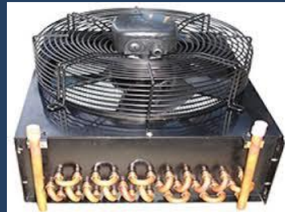
Air cooled Heat Exchanger