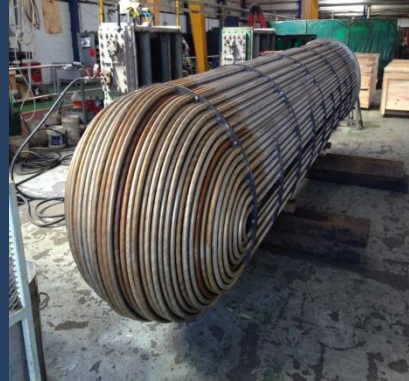
U-Type Heat Exchanger