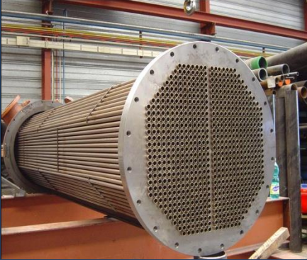
Shell & Tube Heat Exchanger